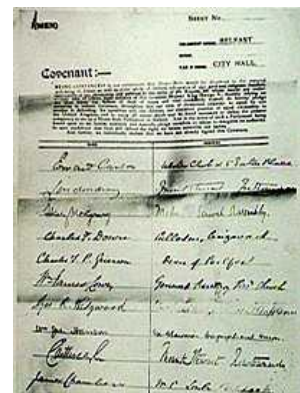
Right: Covenant signed by Sir Edward Carson.